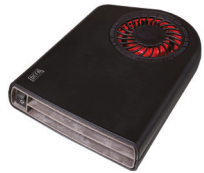
Termini™ II 1400