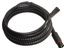
Termini™ extension cable