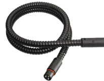
PlugIn extension cables