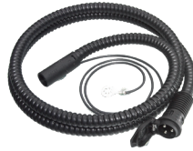
PlugIn inlet cable