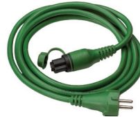
MiniPlug connection cable