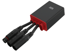
MultiCharger 1205R Flex